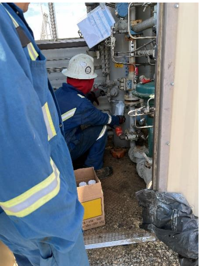
Collecting a produced brine sample at a separator.