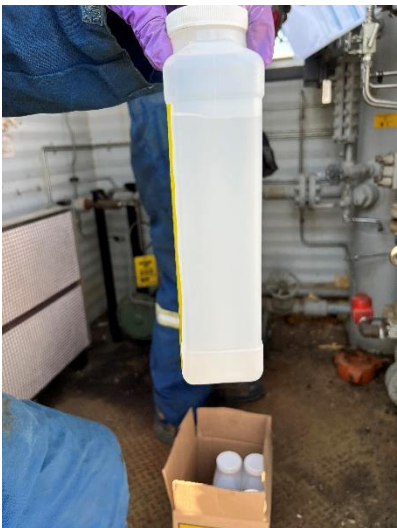
A brine sample.