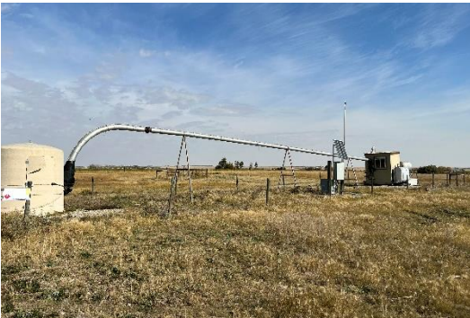
A wellsite that was sampled.